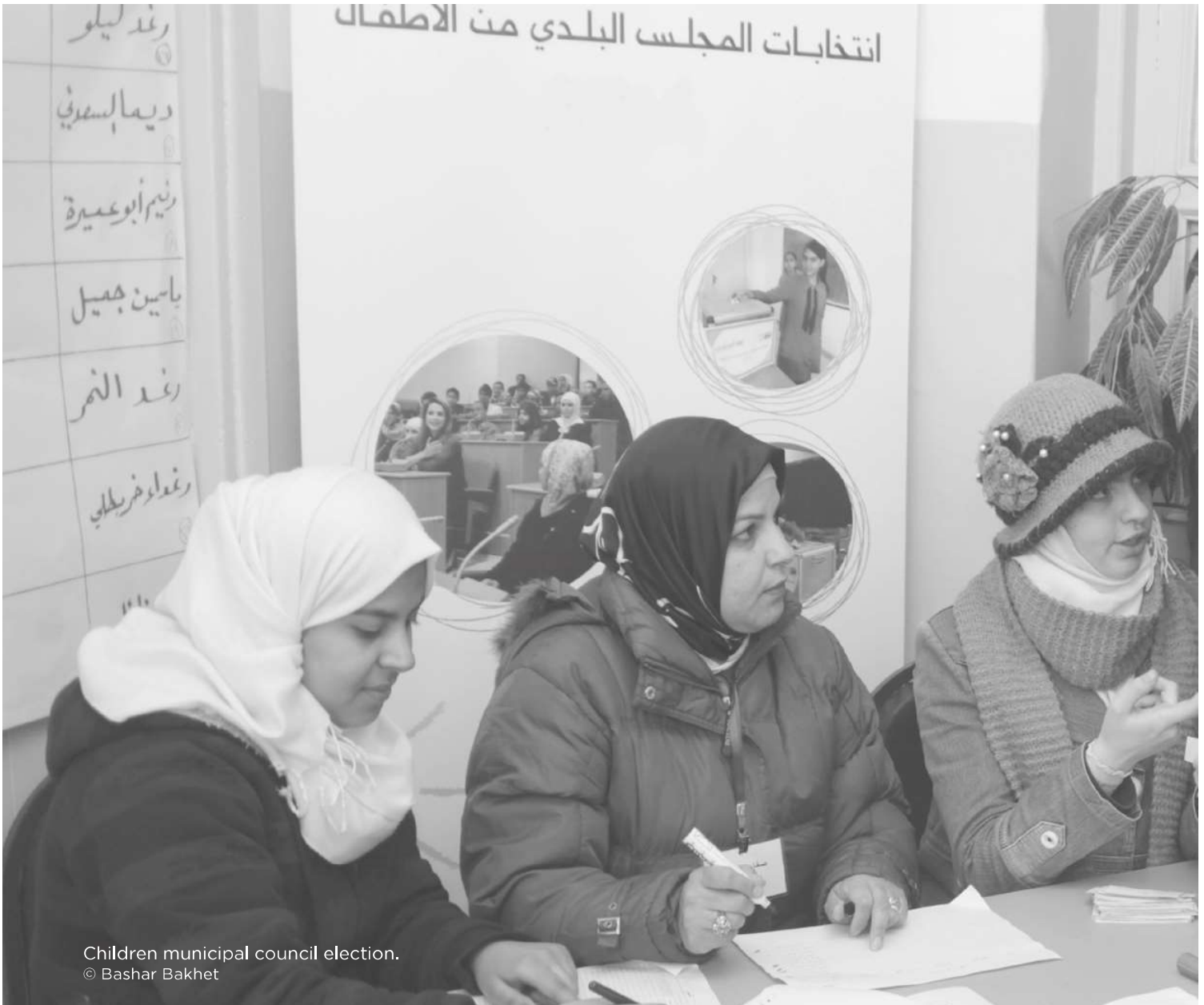
Children municipal council election.