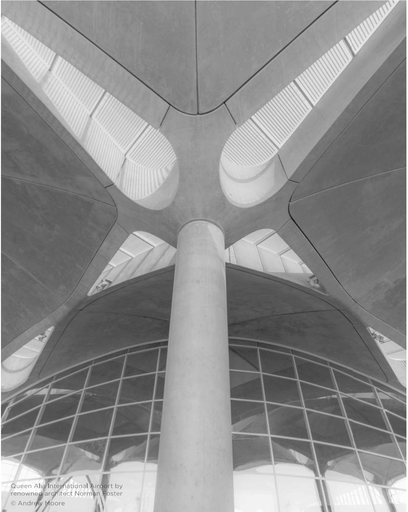
Queen Alia International Airport by renowned architect Norman Foster